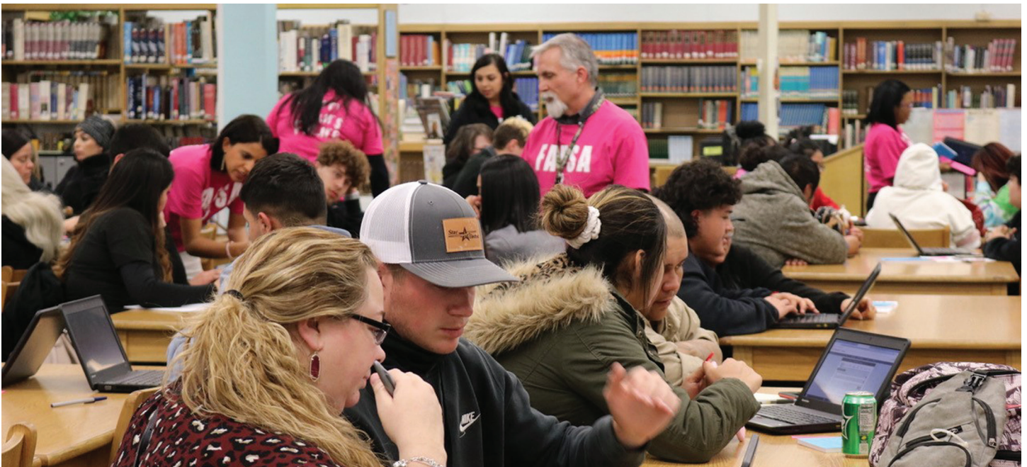
College and career advisors work with families during a February 2020 FAFSA Night in Ector County Independent School District in Odessa, Texas.

The federal government has taken steps to address the complexity of the FAFSA. In December 2019, Congress passed the FUTURE Act, which allows families to consent to the sharing of their privacy protected tax data between the Internal Revenue Service (IRS) and the U.S. Department of Education. This automatically eliminates up to 22 of the questions on the FAFSA. The data-sharing agreement also reduces the number of families selected for the verification process.