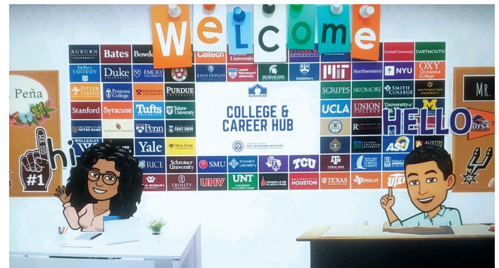
San Antonio Independent School District created virtual College and Career Hubs to help students with postsecondary transitions.

Department of Education to simplify the FAFSA, support the types of strategies that our members have successfully implemented, and put more students on the path to an affordable degree and success in life.