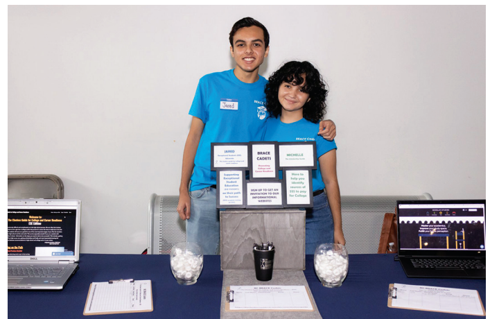
Students in Broward County support their peers in navigating the financial aid process.

Peer influencer program: The district's college advising department—Broward Advisors for Continuing Education, or BRACE—set a goal to increase FAFSA completions by 5 percent in the 2019-2020 school year. BRACE cadets are student advisors who give their peers information about scholarships, financial aid, and the college and career process. When schools closed their doors in the spring, BRACE cadets moved their work online and used social media to reach out to other students.